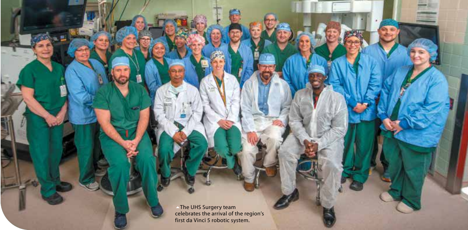
▲ The UHS Surgery team celebrates the arrival of the region's first da Vinci 5 robotic system.