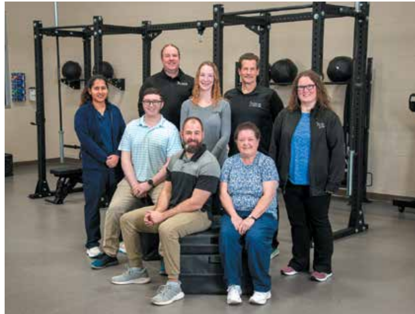
▲ The UHS Physical Therapy & Rehabilitation team is excited about its new, state-of-the-art facility, which offers expanded areas for personalized recovery and performance training.